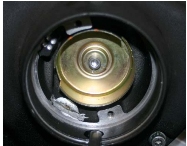
Figure 3 – Ignition Module Orientation